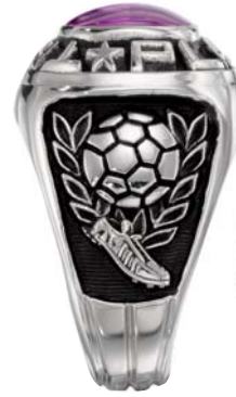
Custom Sterling Silver Rings